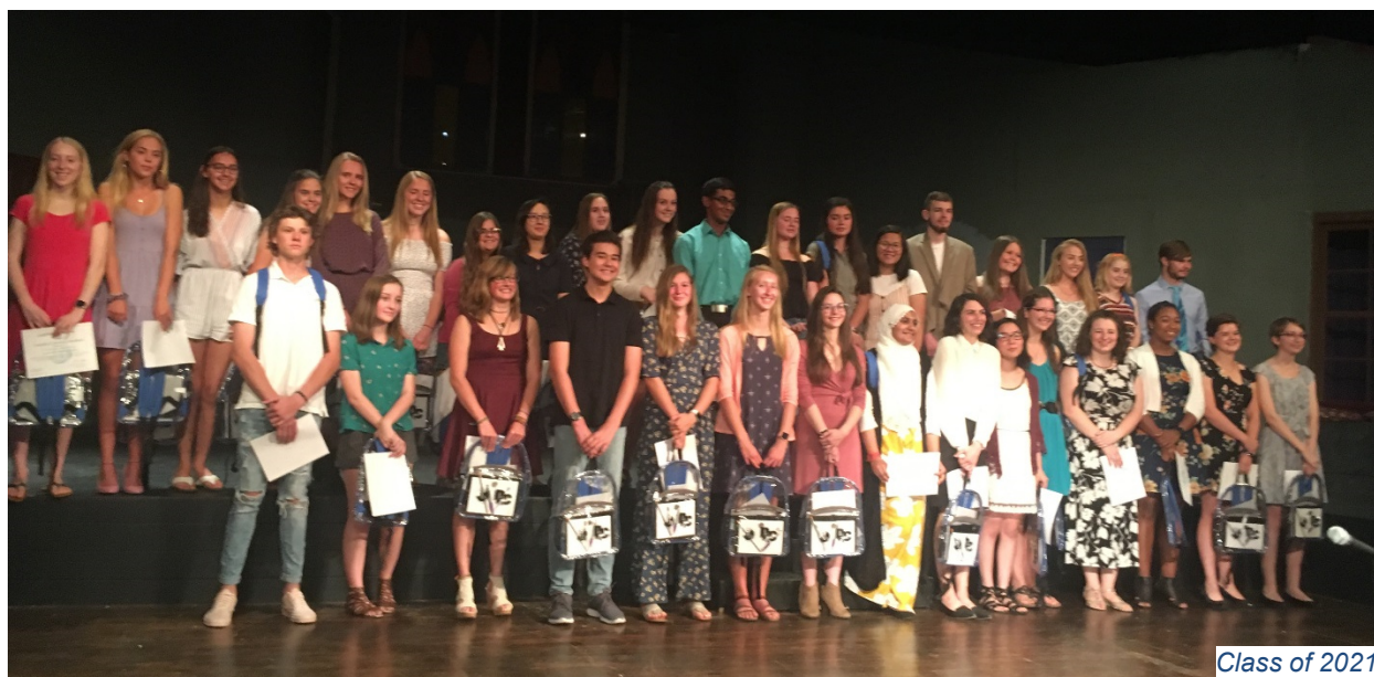
Class of 2021