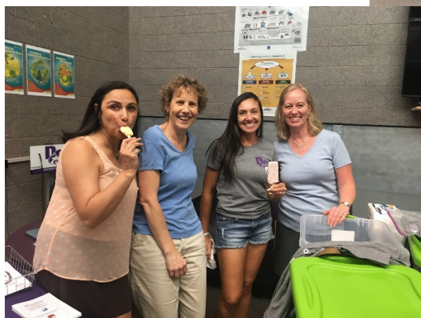
IBPO members eating their own ice cream 😊