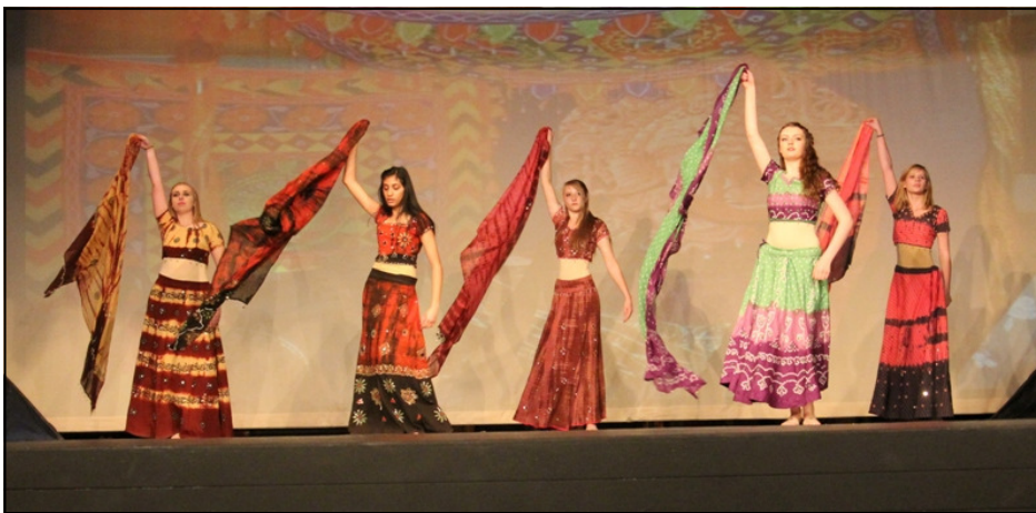
The Bollywood sequence married stunning design and artful movements

If you missed this year's IB dance performance, you missed an enthralling night performed by talented, dedicated dancers. Make a note today to attend this amazing show next spring.