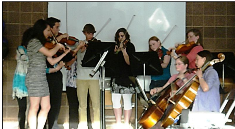
The DCHS Chamber Orchestra closes the night with a musical performance