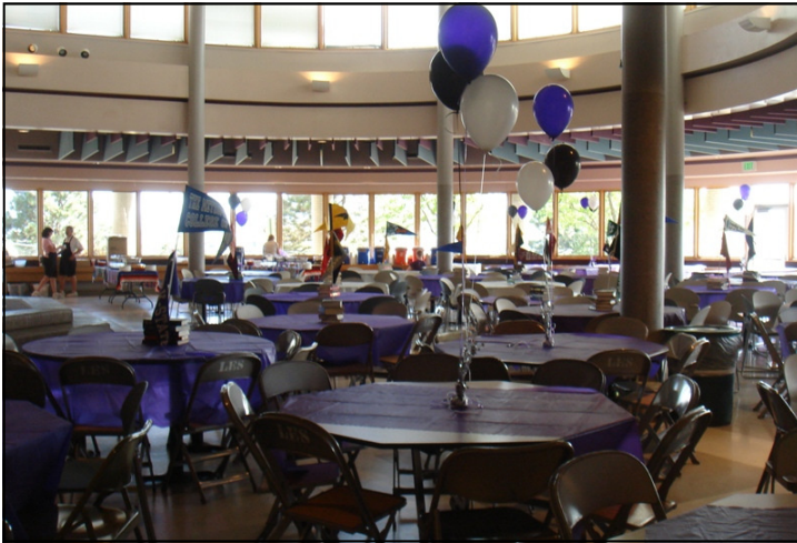
The North Commons decorated and ready for the fun to begin!