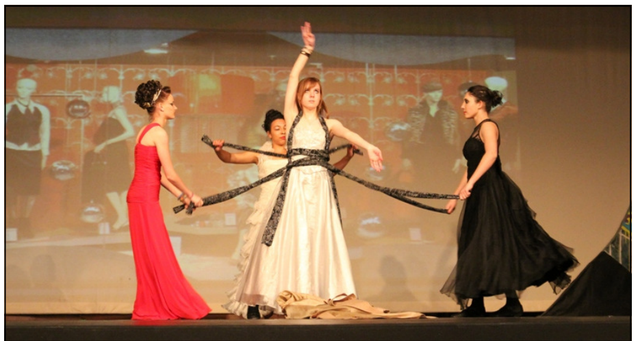
Mannequins prepare for window dressing