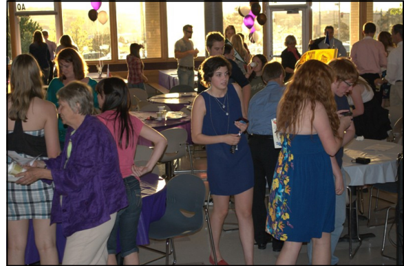
IB students and families enjoying the banquet