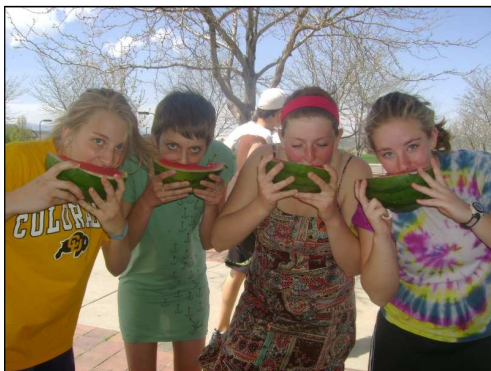
Seniors enjoyed a much earned break from IB May exams at the annual Senior Summer End of Year picnic.