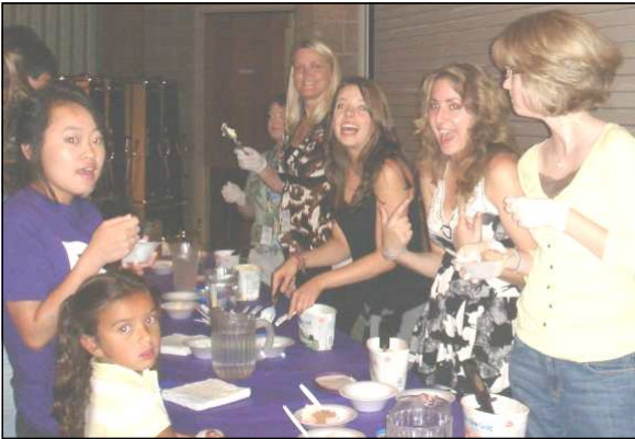
Current IB Parents and Juniors helped serve ice cream to incoming Freshmen and their families.