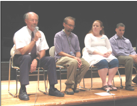
The teacher panel answered parent questions in the theater.