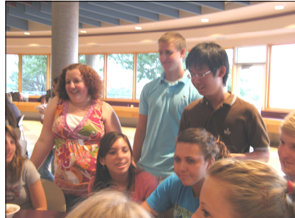
Current IB students answered questions from the new students.